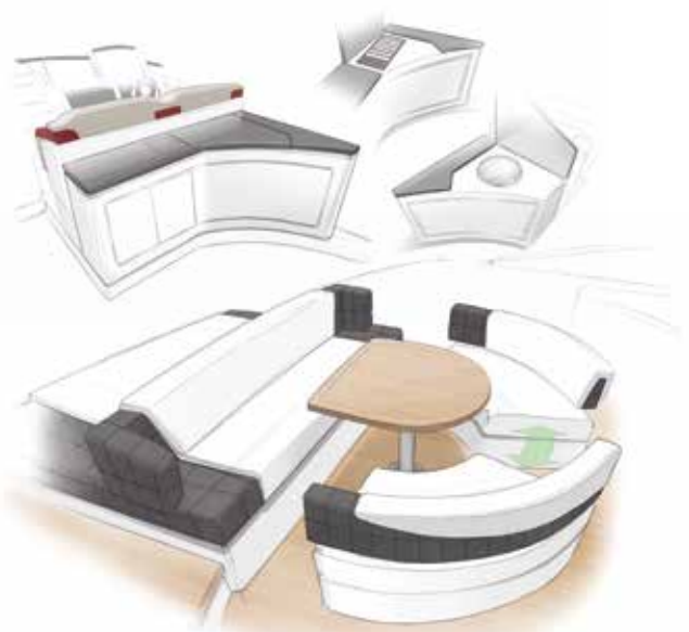
TOP Chandelier over the dining table on the 156' sailing Super Sloop, PINK GIN. MIDDLE IMAGES Mood board ideas to the CAD master visual. BOTTOM IMAGES Windy 39' cockpit sketches.