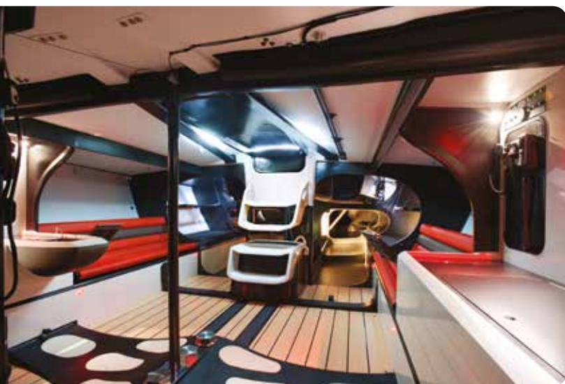
TOP WINWIN Saloon. ABOVE RAN interior. BELOW SHEMARA exterior.